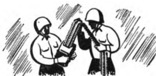
MEN IN CLIP ROOM

This 20-mm team has 6 men. Steward's Mates may be the entire gun crew from clip room to gunner. YOU may be on this team.